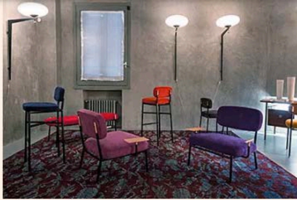
Dualita chairs, price on request, nilufar.com

Another hindrance for the Lebanese design scene is that few people outside the country know what designers are producing there.